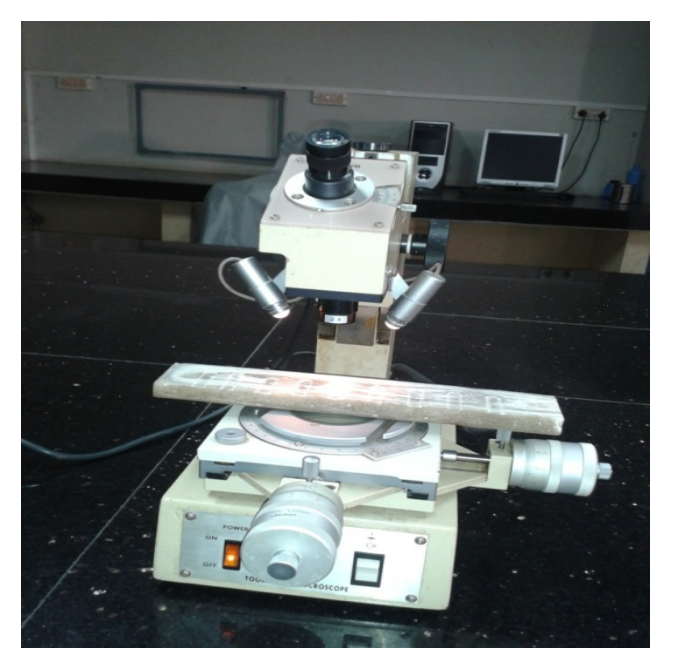
Figure 3: Measurement of delamination damage using Tool makers Microscope

http://www.ijmp.jor.br ISSN: 2236-269X DOI: 10.14807/ijmp.v5i2.152