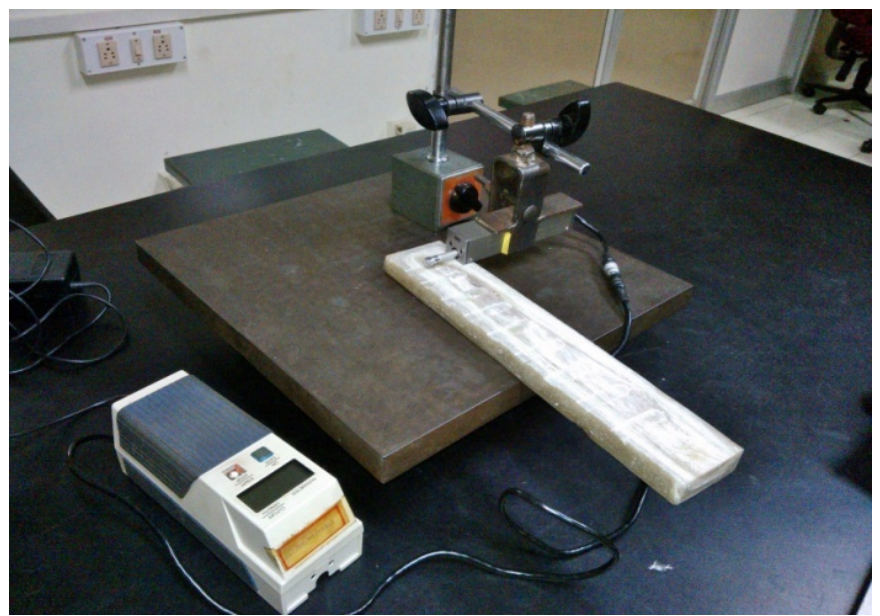
Figure 2: Measurement of surface roughness using Form Talysurf 50 (Taylor Hobson Co Ltd)

The surface roughness parameter used to evaluate surface roughness in this study is the Roughness average (Ra). This parameter is also known as the arithmetic mean roughness value, arithmetic average or centerline average. Within the presented research framework, the discussion of surface roughness is focused on the universally recognized Ra. The average roughness is the area between the roughness profile and its Centre line, or the integral of the absolute value of the roughness profile height over the observed length.