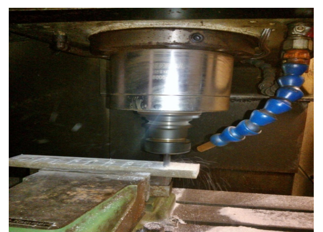
Figure 1: Machining of GFRP by CNC vertical machining center with K10 carbide End Mill

Furthermore the spindle speed (rpm), the feed rate (mm/min) and depth of cut (mm) are regulated in this experiment. Each experiment was conducted three times and the maximum width of the delamination damage (Wmax) around the slot periphery using Travelling Microscope with an accuracy of 10 \mu m is measured at five places on each slot then average of them in mm after that Delamination Damage Factor calculated. Similarly, the surface roughness is measured at five places on each slot then average of them in \mu m is considered by a surface analyser of Form Talysurf 50 (Taylor Hobson Co Ltd). Measured observations are depicted in Table 3 and 4.