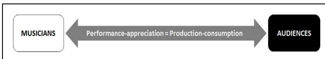
Figure 1: The association between music performance-appreciation and music production-consumption

binominal performance-appreciation. Under this perspective, it is possible to consider the moment of performance as a production process, whereas the appreciation of this performance corresponds to the associated consumption (Figure 1). The production agents are the musicians, who create/produce the performance, whereas the consumers are any appreciative audiences, which would like to invest time and/or money on it (ADLER, 1985). At this level, music production-consumption may occur anywhere within the service-good spectrum and cohere with the physical retail purchase of material recordings as much as with the intangible experience that, according to Herschmann (2010), belongs to the realm of spectacle.