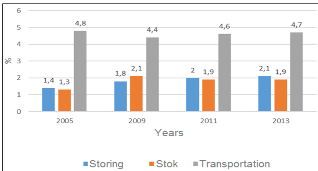
Figure 3: Logistical costs in relation to net income.

According to ILOS (Instituto de Logística e Supply Chains, 2014), the costs can vary according to the transportation mode employed, since each mode has its costs variations, representing 4,7% in relation to the net income of the companies in Brazil, as can be seen in Figure 3.