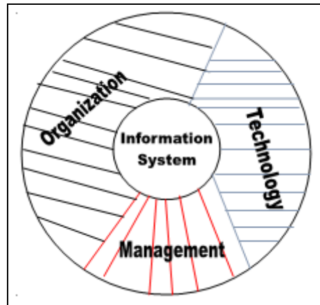
Figure 2: Dimensions of Information System