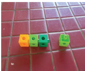
3 (in a line) and 1 by Qaisya

The initial task involved small numbers for the addends (3 and 1). The researcher asked the children to model the addition situation with the cubes and to also obtain the total. The majority of the children were able to represent the quantity and the addition situation easily (refer Figure 2). Whilst manipulating the cubes, Aimy and Rozy counted aloud. "1, 2, 3...4". "4" both said confidently and smiled. Similarly, Qaisya was observed to count softly and slowly as she constructed the first addend "1, 2, 3". "And here 1" as she simultaneously included the second addend. She then counted them all "1, 2, 3 and 4". "4" she said aloud. Note that in exhibiting the first addend, the children demonstrated different ways of presenting the quantity of the addends (i.e. linked them horizontally, grouped them together and linked them vertically).