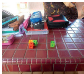
3 (in a group) and 1 by Rozy