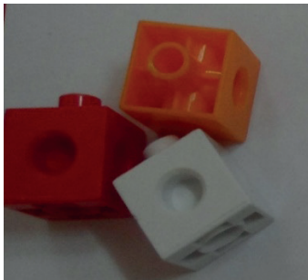
c) 3 cubes Grouped (Nadia)

A group of 3 cubes to represent the quantity '3'