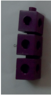
a) 3 cubes Linked (by Norman and Aimy)

A stack of 3 cubes to represent the quantity '3'