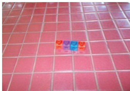
Figure 3: Ali's construction of addition using cubes (the total)

Given the addition situation “ 3+1 ”, Ali lined all four cubes, that were very close to each other, in a straight line (refer Figure 3).