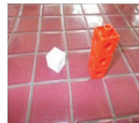
3 (in a pile) and 1 by Aimy