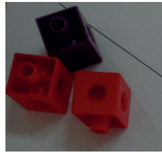
d) 3 cubes Grouped (Ali and Rozy)