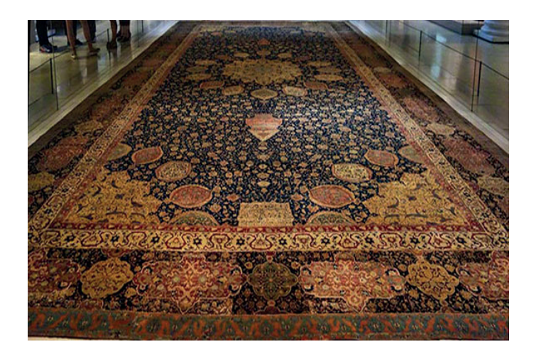
Figure 1- Ardabil Carpet in Jamel Gallery

In the design of the main carpet pattern, there is a sea of delicate shank and leaf motions using Shah Abbasi colors. In the carpet pattern, some mental and spiritual states are felt, including in the navy blue color of its text, that would make the shrine have a sacred state. The presence of two petals on the carpet demonstrates its sacredness and validity, and the carpet medallion containing 5 oval pendants is considered as a sign of the sun. On the margin of the carpet there is a series of frames that also still exist in the tile-work of the monument's ceiling. The use of Turkish knots and wool of Azerbaijan in weaving the carpet and also the necessity of its supervision by the then king who ruled in Tabriz make the possibility of weaving the carpet in this city get close to certainty. The couplet "Save Thy threshold, my shelter in the world is none. Save this door, my fortress-place is none." and the phrase "Work of your servant Maghsud Kashani 946 AH (1540 AD)", which is woven on the carpet, indicate that the weaver is Maghsud Kashani. This carpet is a special milestone in the history of Iranian carpet weaving industry, as it has been woven for the complex and a kind of innovation has been used in its design. The carpet's pattern is absolutely innovative due to the lack of use of geometric shapes that were common in most carpet of Iran at the time. As the years go by, every carpet woven into this motif is still called Sheikh Safi pattern (Jackson, 2016).