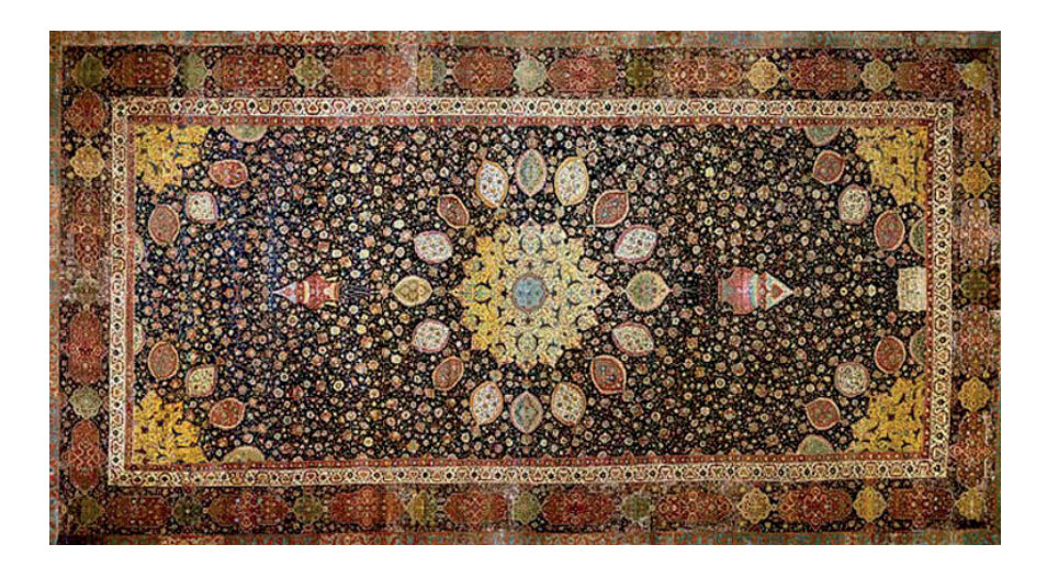
Figure 2 - Ardabil Carpet, Iran c1540 CE, AH 946, Los Angeles County Museum of Art [16]

Ardabil carpet is as a masterpiece of Iranian carpet weaving which has three main characteristics. The first characteristic is that it was woven in the Safavid era, which was the period of development of and attention to the arts, especially the Iranian carpet. On the other hand, in the pattern of this carpet an evolved medallion has been used and finally it has the date of weaving and the name of the master weaver on it. The symmetry and balance in the elements of Ardabil carpet resemble miniature and illustrated manuscripts, and the top and bottom of its medallion is a cryptic motif of the candelabras (Ghandil) that once lighted the sheikh's shrine. Due to the presence of the common motif of the northwest medallion carpets in this carpet (Fig. 3), it is considered to be of this category (Maghsoudi, 2013).