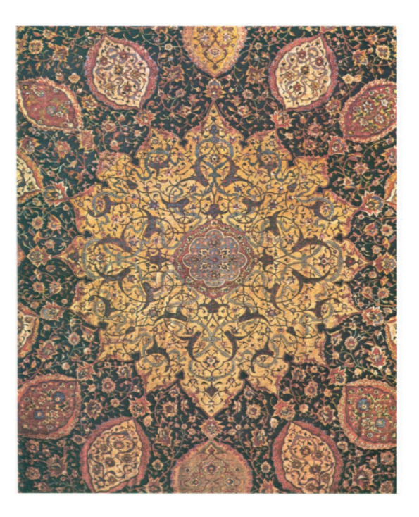
Figure 4- Central Medallion of Ardabil Carpet

The main parameter considered by researchers to study the carpet in order to justify the carpet's pattern is the place for which the carpet has been woven. Ardabil carpet has been woven for the tomb of Sheikh Safi al-Din Ardabili. These candelabras are, in fact, the embodiment of verse 35 of the Holy Surah Nur: Allah is the Light of the heavens and the earth. The example of His light is like a niche within which is a lamp, The lamp is within glass, the glass as if it were a pearly [white] star, Lit from [the oil of] a blessed olive tree, there are small medallions designed around the main medallion and on each side of that there is a candelabrum that symbolizes the sacredness of the carpet and a quarter of the main motif of the carpet is woven on the four corners of the carpet.