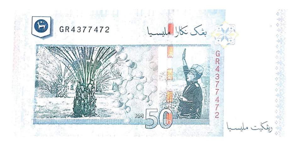
Figure 4. The IOT Note Will Also Keep Track of The Serial Number Being Used