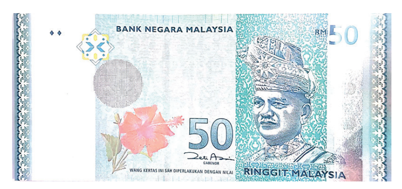
Figure 3. IOT Notes for Multiple Transaction with Digital Signature from Each Transaction

depicted by the green graph in Figure 2. An electronic money has been created by financial provides without any attachment to any paper money. Bank Negara Malaysia will start losing on the moment of electronic money in a cashless transaction. In this paper, an IOT note for multiple session will attach itself to real paper money note as shown in Figure 3 [14]. The IOT note movement across multiple transactions can be tracked down by control authority as each IOT note will be beads on the paper money kept by the banks as shown in Figure 4. At the same time, the velocity of the paper's money can be traced from all the transactions. It is going through. The electronic money has been in the current form an issued by the banks or financial provider with minimum controls from the central bank. In this IOT system, the supply of money (M1) and the velocity of money will be under control by the Bank Negara Malaysia.