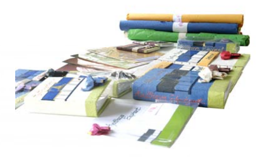
Figure 1 Prototype of elephant dung paper.