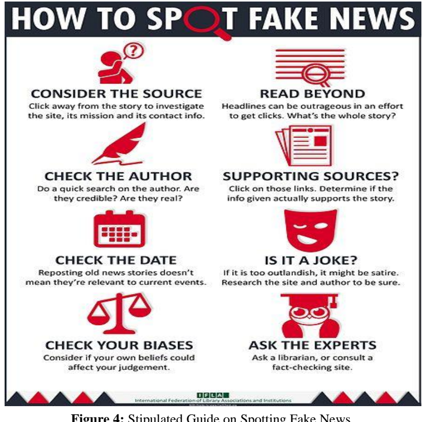
Figure 4: Stipulated Guide on Spotting Fake News