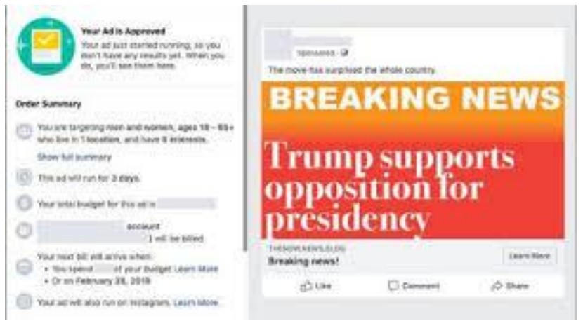
Figure 3: Fake News on Trump-Supporting Atiku