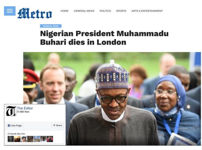
Figure 2: Fake News of President Muhammadu's Death

<u>Ugwuanyi (2017)</u> reported that a major instance of fake news that dominated Nigeria's social media space was the rumored death of President Muhammadu Buhari shortly after he began a health leave to the United Kingdom on January 19, 2017 (See Figure 2). Many Nigerians shared and reshared on social media that the President was dead and cloned or replaced by a Sudanese called "Jubril," causing an uproar and confusion among many people. This fake news made many to lose faith in the Nigerian government. Likewise, <u>Edwin and Yalmi (2019)</u> study found that in October 2019, there was widespread information circulated on social media suggesting that the President is taking another wife. To substantiate this rumor, invitation cards were also circulated. After a few days, the President debunked the issue stating that he had no plans of taking another wife. Incidence like this demonstrates how viral fake news could be disseminated among the Nigerian populace without much verification. Such fake news spread is continuously destabilizing the system, political stability, inciting people to violence and weakening the people's confidence in the present government. Creators of fake news could have committed this act to discredit the government for political reasons. No doubt, Nigerian political rivalry is intensifying in recent years and this could contribute to widespread rumour mongering that could undermine any sitting government.