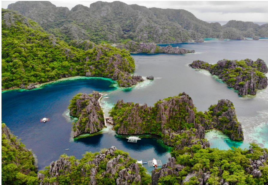
FIGURE 1. AERIAL SHOT OF THE TWIN LAGOON IN CORON ISLAND, PHILIPPINES.

Specifically, consumer drones attract increasing attention because of their unparalleled ability to take breathtaking photos from various angles. See Figure 1 below. Amazingly, the stunning photo below, for example, did not “require a helicopter and a Michael Bay budget.” 326