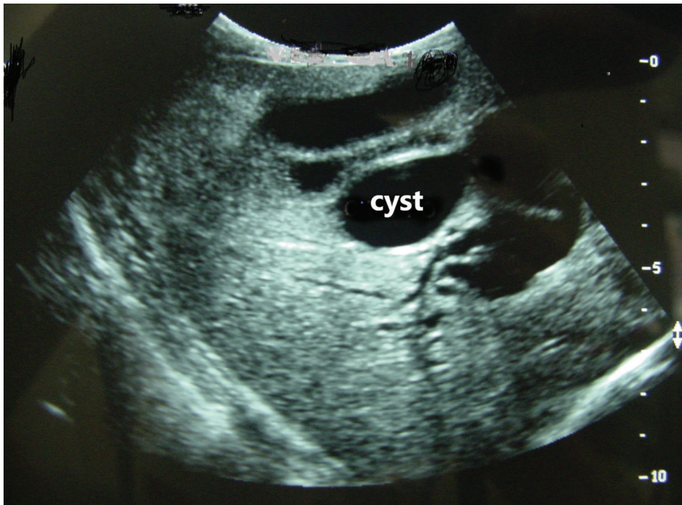
Figure 1 - US image of choledochal cyst. Note that no other examination is necessary for surgery planning.

In our service, most choledochal cyst cases were referred from primary or secondary care public medical services. Some cases were referred to our institution with prior imaging exams, such as US, magnetic resonance cholangiopancreatography (MRCP) or computed tomography (CT). In these cases, US was repeated under our care, and if the diagnosis was confirmed, surgery was recommended for the patient.