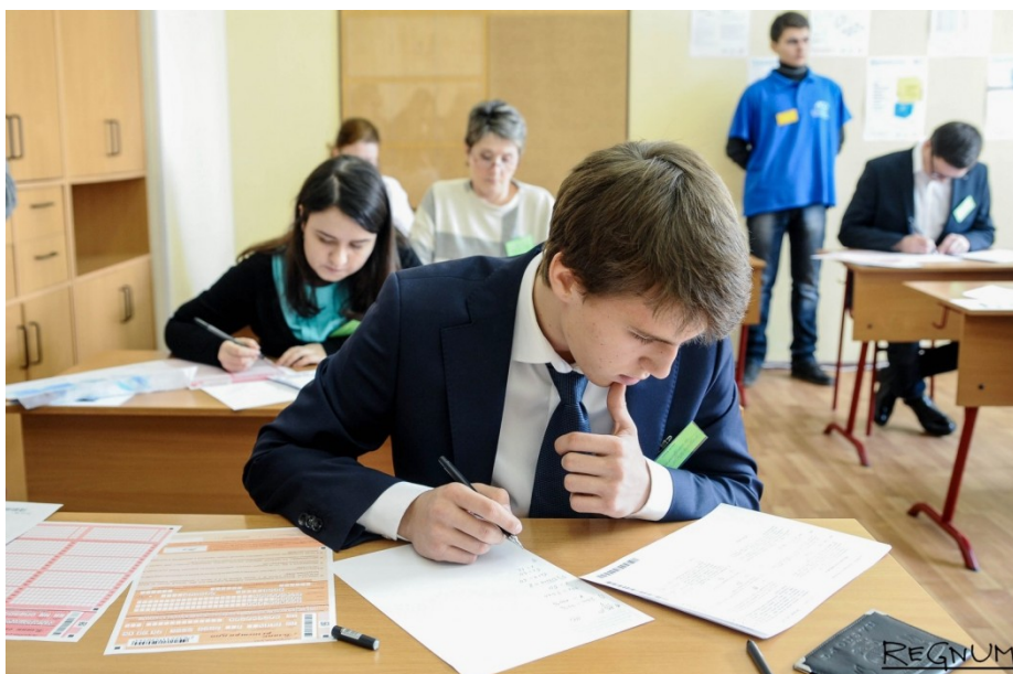
Figure 5: Schoolchildren in Kaluga pass the exam in social studies