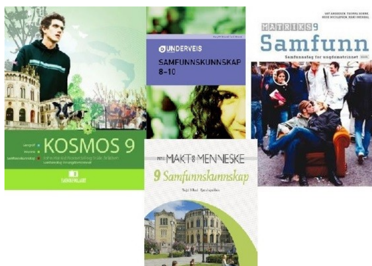
Figure 1: Frontpages of the most common social studies textbooks for upper secondary school in Norway