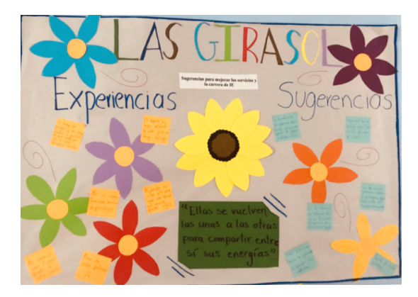
Figure. 8: Poster of the Sunflowers group.

Finally, the students commented that there have been cases of lecturers harassment towards the students. Also, they do not know the process to report these cases and they do not feel support from university authorities.