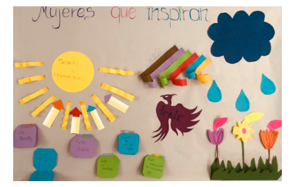
Figure. 10: Poster of the Phoenix group.

1) Confidence in myself: several participants mentioned that this activity increased their value in