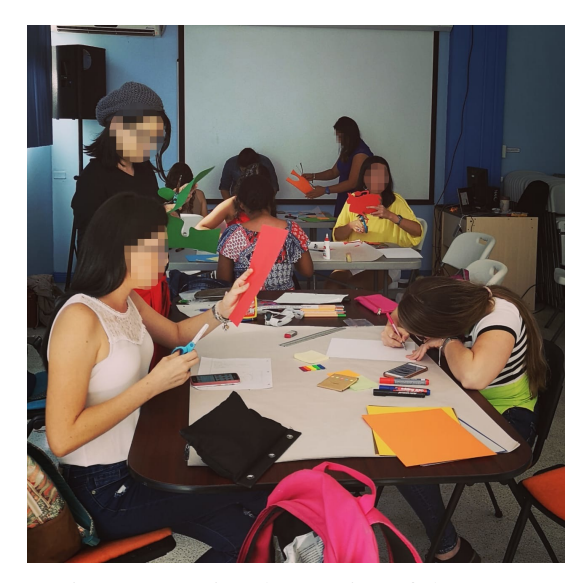
Figure. 2: During the creation of the poster.

In the creative activity each group created a poster to transmit the message that they wanted to utter. The groups used physical materials e.g. colored paper, scissors, colored markers, rules, gum, Postit, among others. Each group had 1:15 hour and the poster had to be designed in an original way. The Figure 2 shows the participants working in the design and creation of the poster.