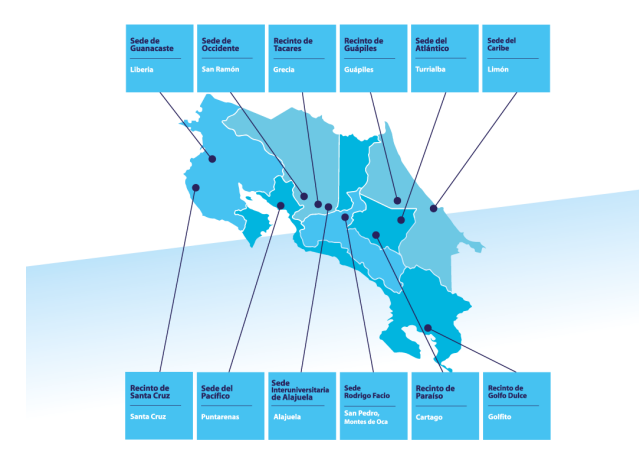
Figure. 1: Campuses of the Universidad de Costa Rica.

Occidente zone of Costa Rica, another one in the Pacífico zone (who lives in the Occidente zone while studying) and one lives in the capital city: San José (who travels every day to the Occidente zone).