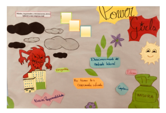
Figure. 7: Poster of the Power-Girl group.

The poster had a drawing of a trash can (see Figure 7), the members of the group explained that it was to throw away their fears, anxieties and bewilderment.