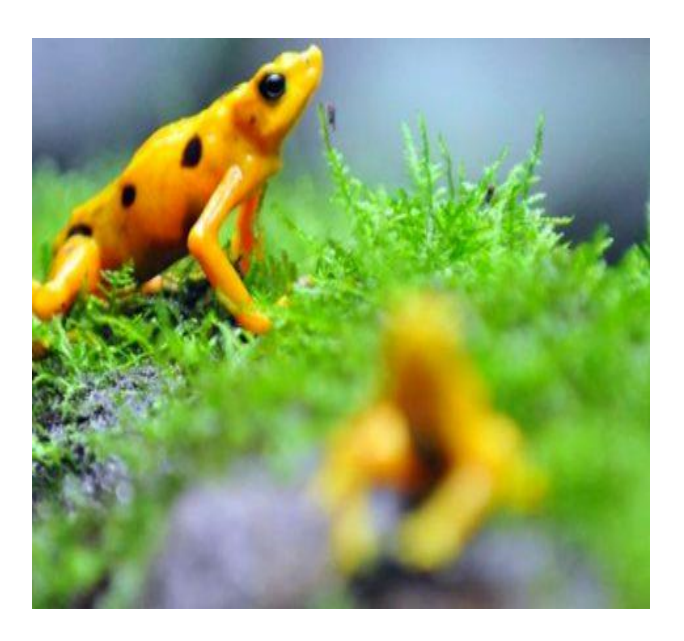
Figure 2. Golden frog.

Our scientific researchers are a truly international group, with 14 nations represented in their group. During our 100+ years in Panamá we have produced more than 14,000 scientific publications, and in 2019, had our best year ever, with more than 500 science papers released, an average of one paper every 17 hours! This work is a mixture of basic research as well as highly applied work, such as research on conservation of a national symbol, the golden frog (Rana Dorada), which is extinct in the wild because of a global fungal disease. Fortunately, we have enough of these amphibians in our quarantine facility in Gamboa where we can breed them for future release back into the wild.