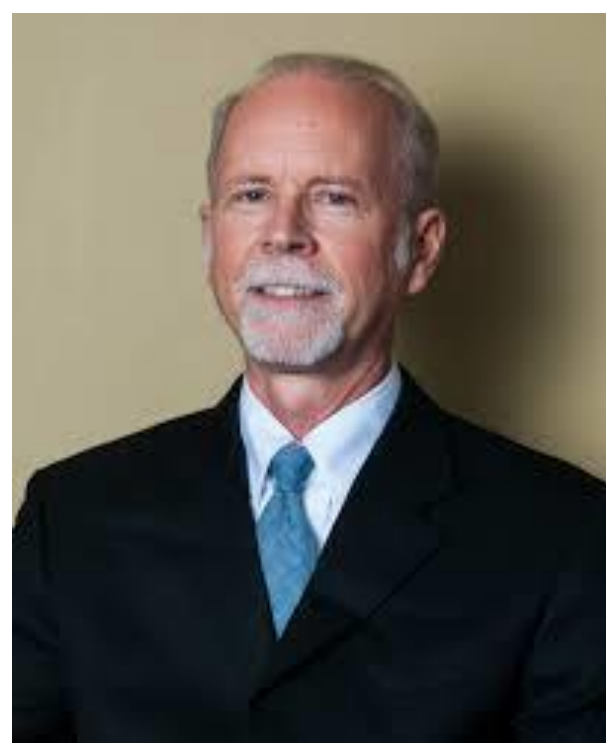
Figure 1. Dr. Mathew Larsen.

The Kyoto protocol and Paris agreement are a good start to solving our global climate change challenge, but by themselves,