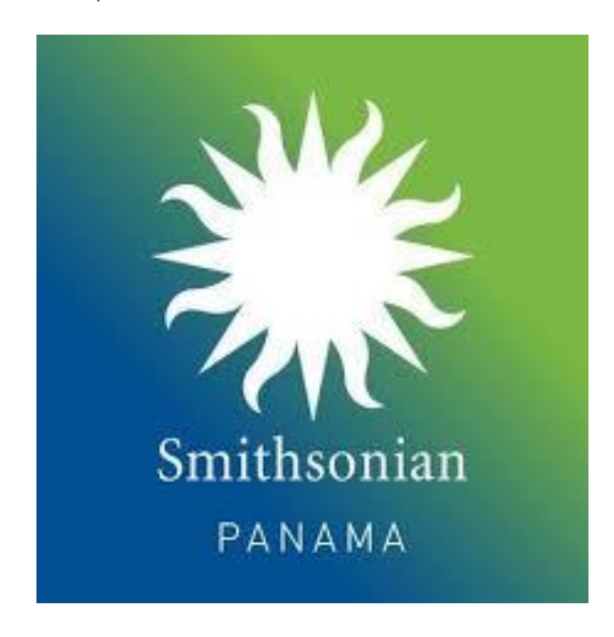
Figure 3. Logo of del Smithsonian Institute Panama.

Panamá is a wonderful place to work and I have enjoyed my time here, getting to know the rich and diverse culture that has developed here, at the crossroads of the world.