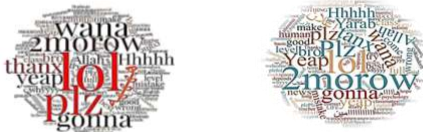
Figure 2. Word Clouds of Online Interlocutors’ textese (Adopted from Al-Kadi, 2017)

Al-kadi (2017) studied how L2 learners contact with each other and with their teachers online (Facebook as a case in point). The author used a word cloud of the corpus collected from a sample of English learners and teachers (the results are shown in the following figure). Word cloud (A) was taken first and after a while Word Cloud (B) of the corpus was generated of the same informants.