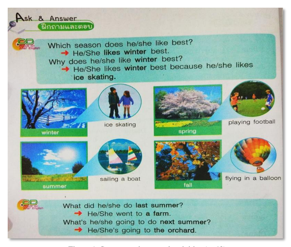
Figure 1. Seasons and seasonal activities (p. 40)

favorite seasons. The talk involved winter, summer, swimming, snow, and skiing. The teacher asked the students to repeat after the CD and pair up for a conversation drill. In the next section, the teacher asked the students what season they like best and what activity they did or are going to do during the summer. Four season pictures, such as winter, spring, summer, and fall together with pictures of Western children, with blond hair, ice skating, sailing a boat, playing soccer, and flying in a balloon were presented in Figure 1.