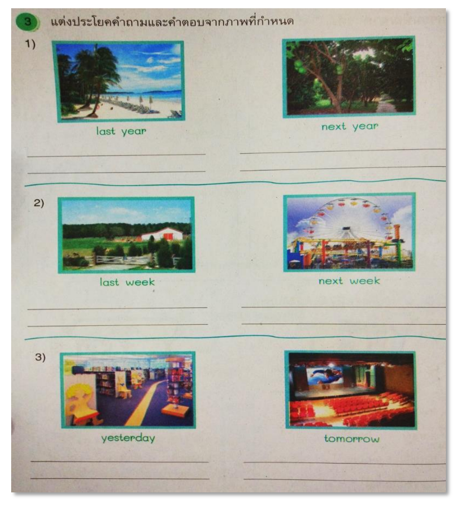
Figure 4. The writing task with provided pictures and adverbs of time (p. 48)

the world. As Matsuda (2002) puts it, "the depth in which students can explore different countries in the world ... tends to be limited" (p. 436). Much of the presented cultural information is also incompatible with the students' social identities or cultural capital. Being exposed to unfamiliar lifestyles, such as traveling abroad, eating Western food, or shopping on Oxford Street, the students may find it difficult to engage in a discussion (Kramsch & Sullivan, 1996).