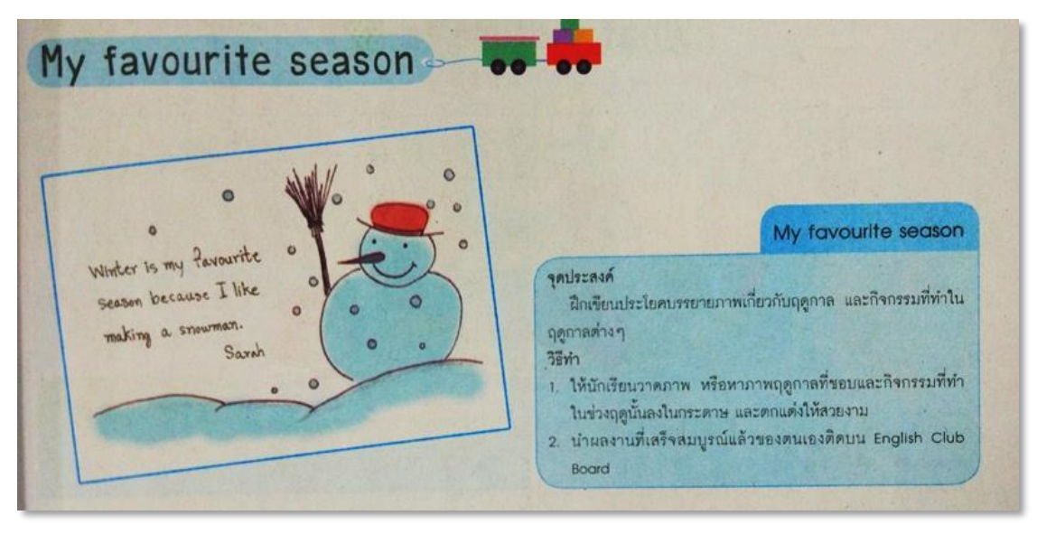
Figure 3. My favorite season (p. 43)