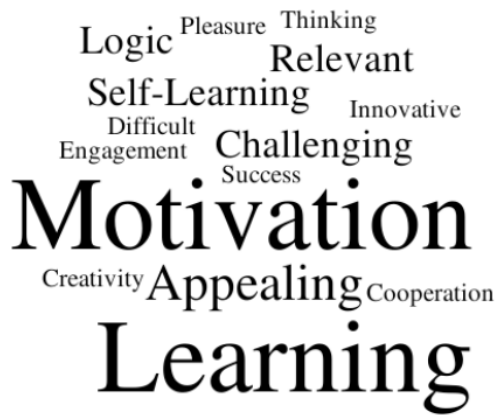
Figure 2. Word Cloud of teachers' beliefs about videogames and learning

Regarding the inclusion of media education in formal schooling contexts, teachers' answers agree on the relevance of the inclusion of media education in formal schooling. Nevertheless, teachers have different beliefs about the process of inclusion media education. Most of the participants considered that media education must be mandatory and transversal in the curricula. Otherwise, three participants considered that media education should be a supplement to the mandatory curricula to be promoted in ateliers or workshops. A relevant aspect is that most of the teachers believe that the usage of media as pedagogical tool, is the best way to promote MIL, in a more engaging and effective way. Moreover, some participants considered that the inclusion of media education in the formal schooling context would require deep changes in the curricular goals and content, such as more flexibilization and possibility to adjust the curricula to every school or group of students.