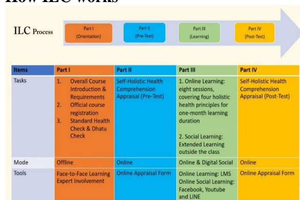
Figure 2: ILC Process

ILC simply has four main parts. All learners are necessary to completely participate in all parts. Thus, this section answering the 3 rd research question on the function of ILC.