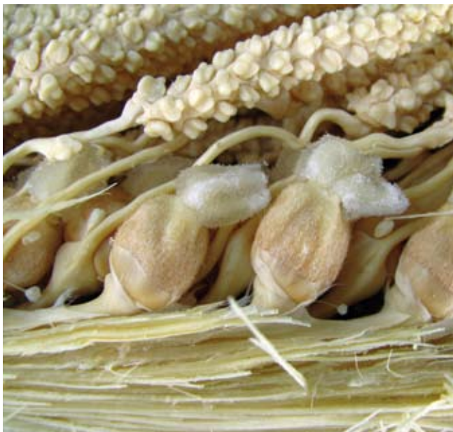
Figure 3. Astrocaryum ulei , pistillate flowers at anthesis.

We did not encounter Astrocaryum ulei on the southern side of the river Madre de Dios, where it is replaced by Astrocaryum gratum that is distributed all the way to the Andean foothills in Cusco and Puno Departments and in Bolivia. The two species are easy to distinguish on the basis of the following characters: (i) pistillate flower, the calyx is cup-shaped and much shorter than the corolla in Astrocaryum ulei ; it is pitcher-shaped and longer than the corolla in A. gratum ; (ii) perianth in fruit, with a staminodial ring forming a regular disk slightly crenulate in A. ulei ; staminodial ring lobed and 6-toothed in A. gratum ; (iii) Astrocaryum gratum is never caespitose and the trunk frequently reaches up to 15 m in height.