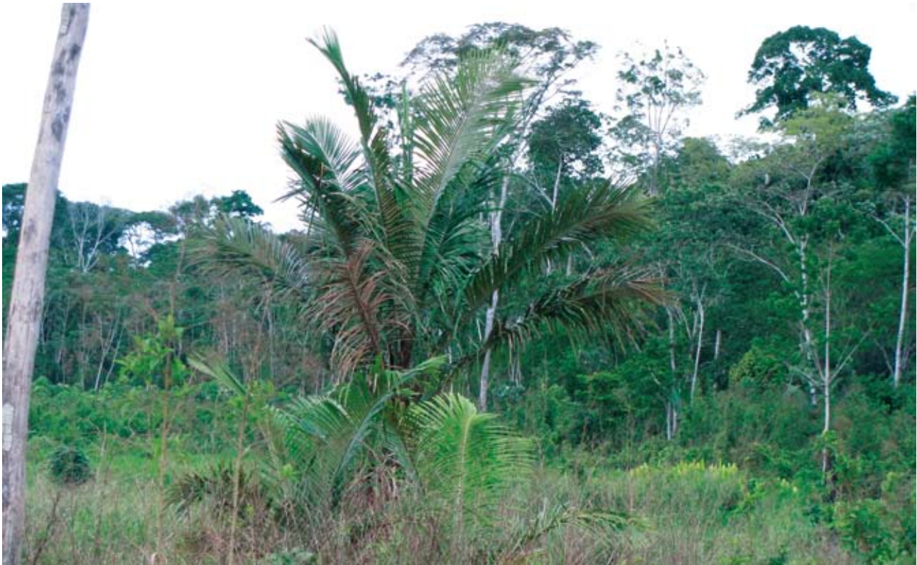
Figure 2. Astrocaryum ulei , the palm.

We did not encounter Astrocaryum ulei on the southern side of the river Madre de Dios, where it is replaced by Astrocaryum gratum that is distributed all the way to the Andean foothills in Cusco and Puno Departments and in Bolivia. The two species are easy to distinguish on the basis of the following characters: (i) pistillate flower, the calyx is cup-shaped and much shorter than the corolla in Astrocaryum ulei ; it is pitcher-shaped and longer than the corolla in A. gratum ; (ii) perianth in fruit, with a staminodial ring forming a regular disk slightly crenulate in A. ulei ; staminodial ring lobed and 6-toothed in A. gratum ; (iii) Astrocaryum gratum is never caespitose and the trunk frequently reaches up to 15 m in height.