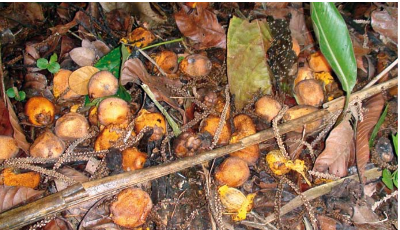
Figure 5. Astrocaryum ulei , ripe fruits fallen on the ground.

This work was done under the agreement between UNMSM/ Universidad Nacional Mayor de San Marcos, Peru and IRD/ Institut de Recherche pour le Développement (UMR DIAPC), France, and supported by the PALMS project funded by the European Community, 7th Framework Programme, Grant