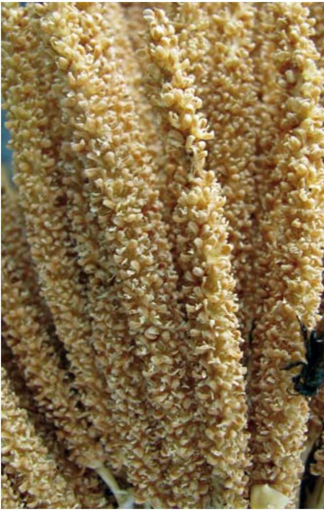
Figure 4. Astrocaryum ulei , staminate flowers at anthesis.

1,5 mm long; pistillode minute, 3-parted. Pistillate flower 11–17 mm long including stigmas; calyx glabrous, pergaminaceous, cup-shaped, tridenticulate, 2,5–3 mm long; corolla oblong to cask-shaped, more or less asymmetrical, 7–10 mm long, armed with many short and brown spines; staminodial ring entire, 2,5–5 mm long; pistil cone-shaped, tomentose, covered with bristles, these soft, zigzag, whitish in the proximal part, black in the distal part; stigmas 3, 3,5–6 mm long. Fruit subglobose, obovoid to turbinate, laterally flattened, 2,5–3,5 cm x 1,7–2,6 cm wide, 3,1–6,2 cm long including a 2–4 mm long beak, with a pedicel (base of the rachilla) to 3 cm long; exocarp yellow to brown, covered with black bristles 1–3 mm long; mesocarp yellow, fleshy, fibrous, 2–5 mm thick; endocarp 2,1–4 cm long, asymmetrical, ovoid to turbinate and acute basally. Fruiting perianth with corolla 9–14 mm long, cup-shaped, deeply crenate, brown setose in the distal part; staminodial ring shaped as a regular disk, minutely crenulate, 5–8 mm long; calyx 3–9 mm long, glabrous, divided in 3–5 lobes, limb usually ivory-white, brown distally.