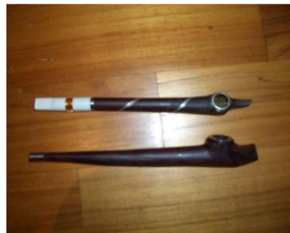
Figure 1 Midwakh.

Spirometry was performed by using a handheld spirometer (Vitalograph alpha and one alpha, Vitalograph Ltd UK). The accuracy of the devices were calibrated against our laboratory spirometer (Master screen Care Fusion Corporation, Delaware, USA). Pre-bronchodilator (pre-BD) spirometry was performed to identify airflow limitation (ratio of FEV 1 /FVC < 0.70) compatible with COPD. The severity of airflow limitation was staged according to the Global Initiative for Chronic Obstructive Lung Disease (GOLD) guidelines as mild, moderate, severe, and