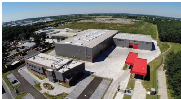
Fig. 2. MASTER company ( https://www.master.tychy.pl/ )