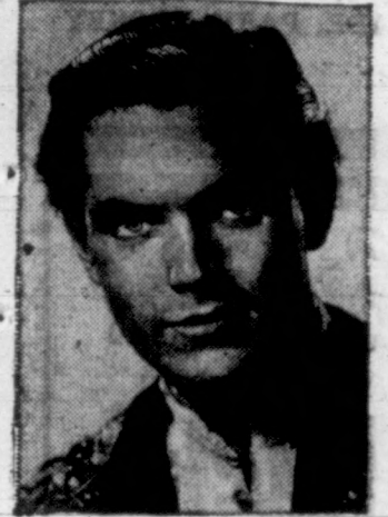
Popular Jeffrey Hunter stars in "Princess of the Nile", now at the Air-Conditioned Varsity Theatre. Filmed in Technicolor, the Panoramic Production is released by Twentieth Century-Fox.

Call 1091 For Appointments JEAN'S BEAUTY SHOP Phone 1091 103 NO. 5TH ST. MURRAY, KY.