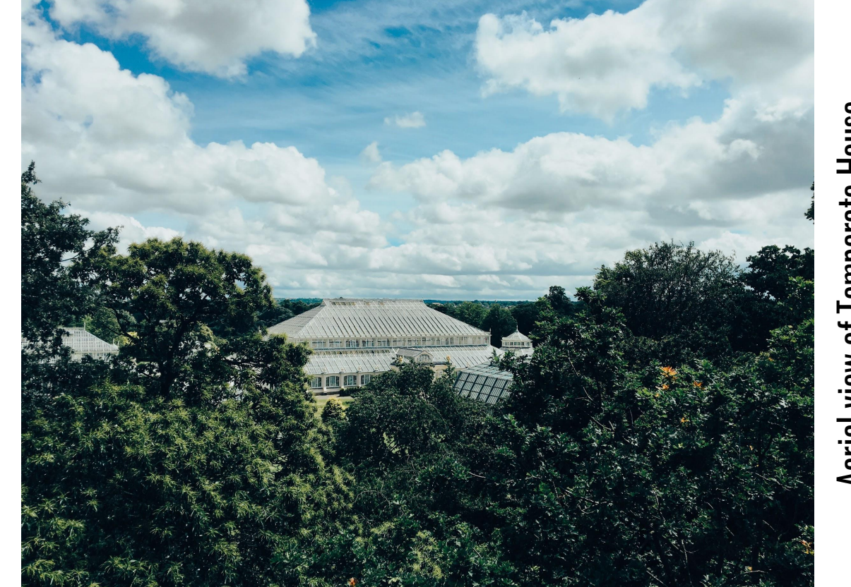
Aerial view of Temperate House