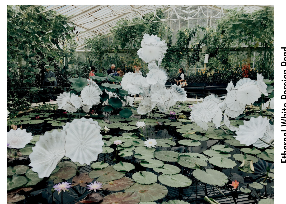
Ethereal White Persian Pond