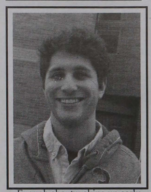
Enough about waking up early, happiness, and love. Let's get to what I do best: film.