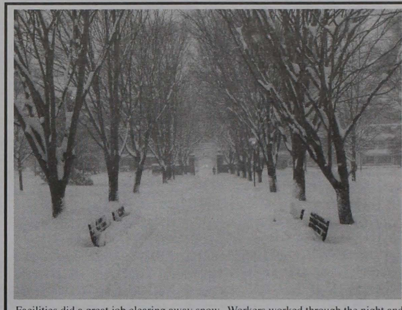
Facilities did a great job clearing away snow. Workers worked through the night and into the afternoon to help clear walkways and sidewalks.