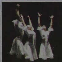
Hispania visits UC Page 5