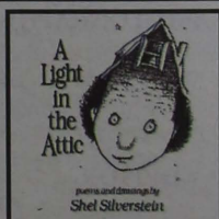
Banned Books Trivia Page 3