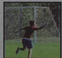
Cosmic Sucker Punch Page 11