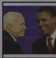
Presidential Candidates Page 8