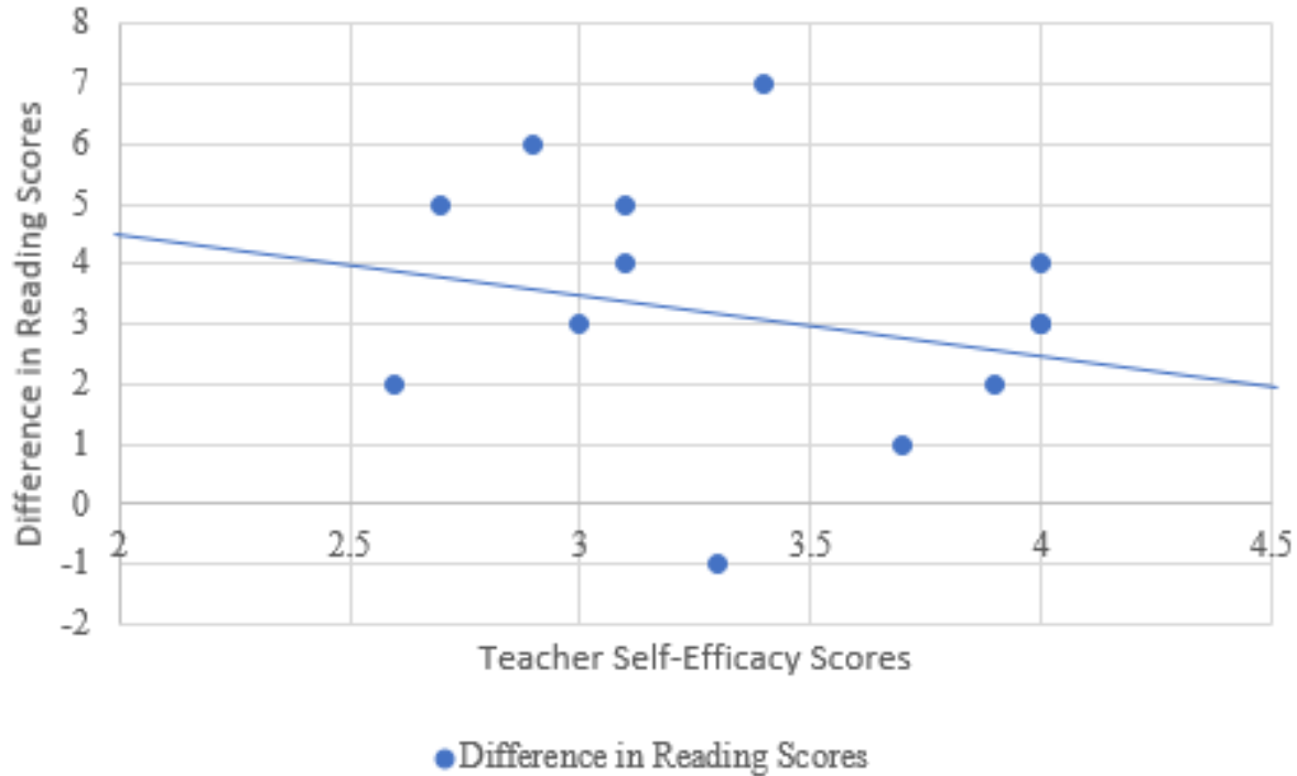
Figure 2 shows eight classes scoring above the regression line and five scoring below. While some scores fall fairly close to the regression line, there are also a few outliers. For example, a teacher with a mean self-efficacy score of 3.4 had a difference in NWEA RIT Reading scores of 7, which is higher than any other class.

Correlation and Regression Test Results for Reading