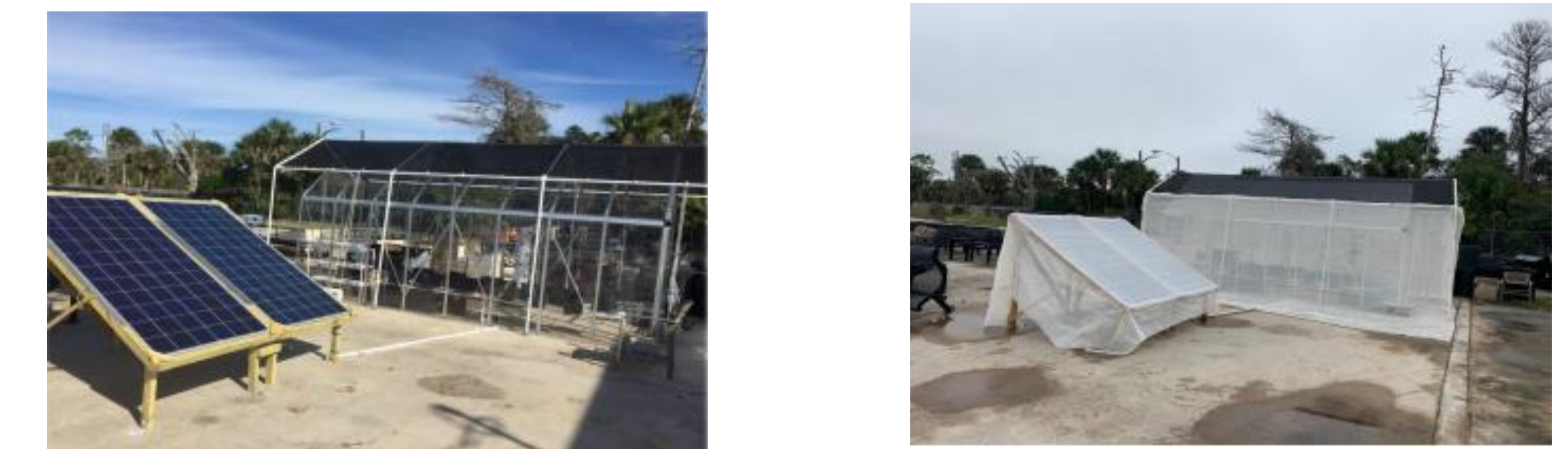
Figure 1: Greenhouse and solar panels