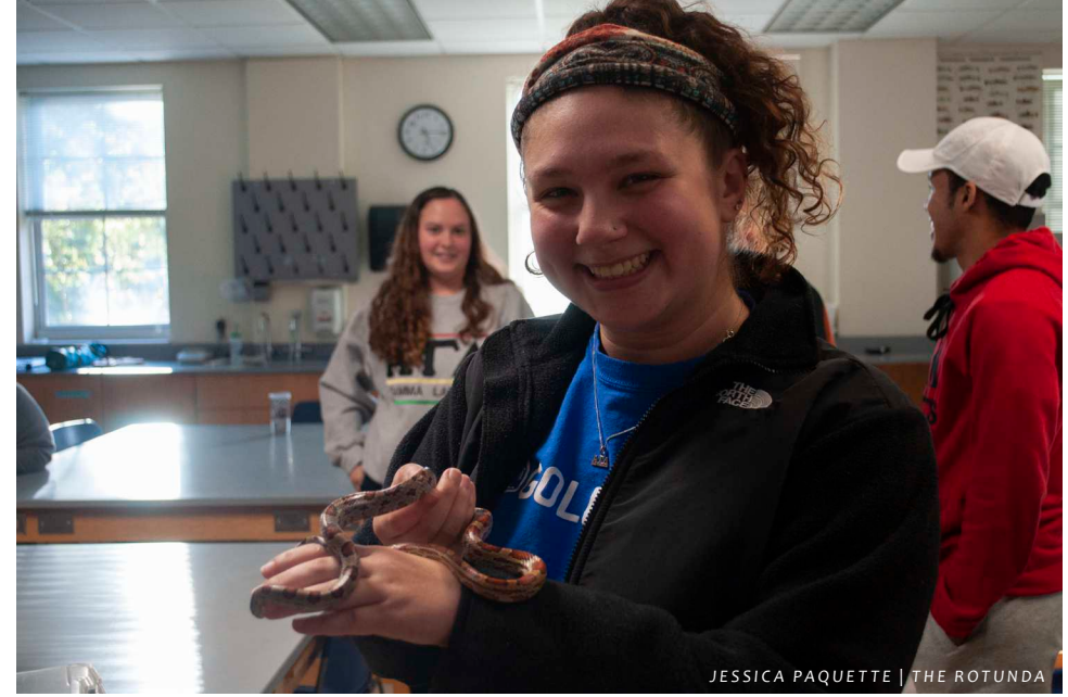
Students hold and pet the corn snake at the end of the presentation. Corn snakes are a nonpoisonous snake found in Virginia.

After the presentation, the first creature he pulled out was a rescue female C o r n s n a k e which is similar to other snakes in Southside Virginia. This was the creature