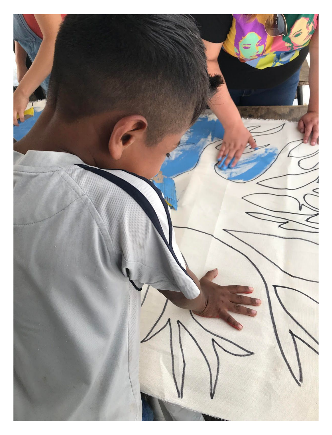
Figure 2. Child paints "tree mural" in Huejotal, Huaquechula. May 14, 2018.