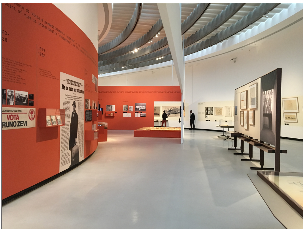
Figure 5: Zevi's Architects, exhibition installation at MAXXI.