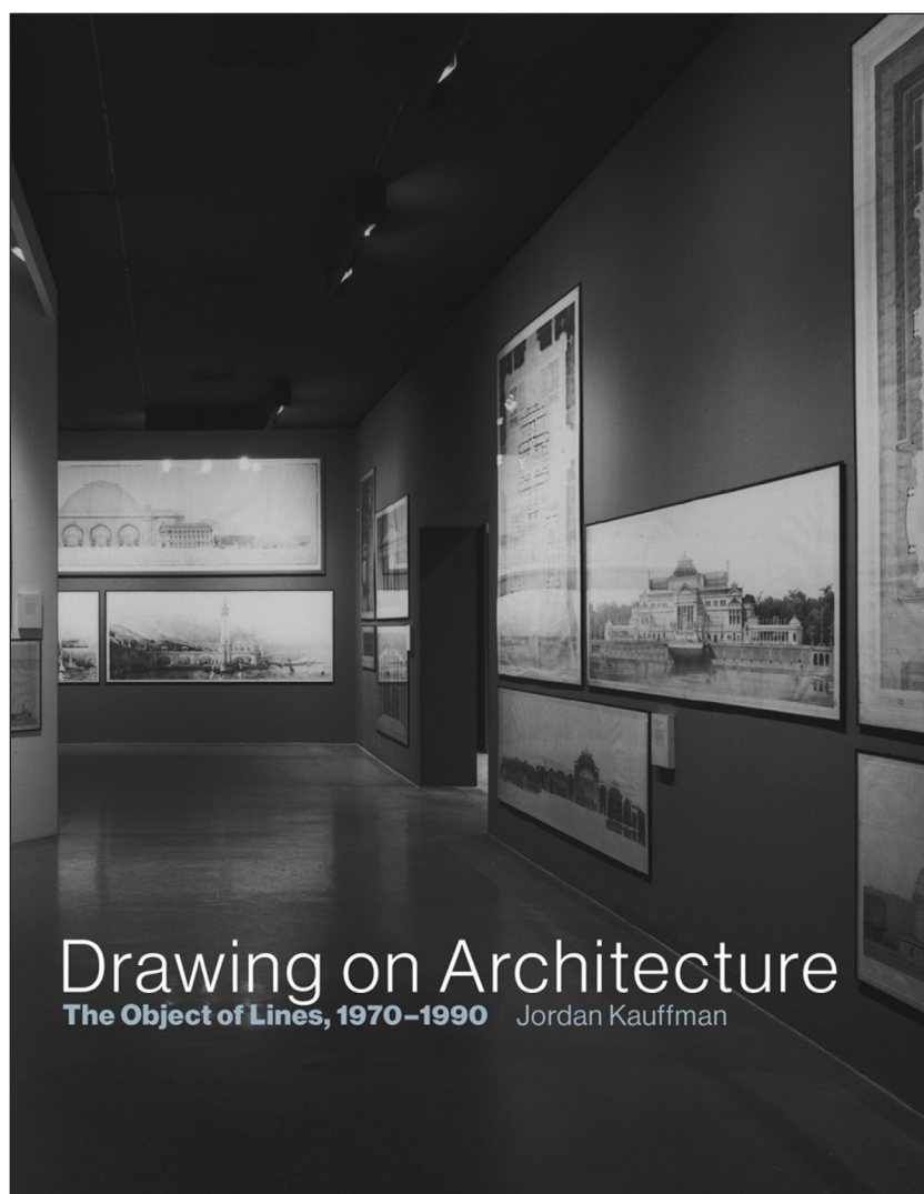
Figure 1: Book cover of Jordan Kauffman's Drawing on Architecture: The Object of Lines, 1970–1990 .

Four different types of collectors are described: private collectors, corporate collectors, commercial galleries, and major art institutions. According to Kauffman, these architectural drawing collections, beginning in the 1970s, gave rise to 'understanding architectural drawings as autonomous objects' as they began 'to be understood as art'. An entire chapter is devoted to the impact of architecture shows at the Leo Castelli Gallery. Already respected for launching careers of leading modern artists, in 1977 Castelli mounted the second commercial show in New York of contemporary architectural drawings. Despite a lack of commercial success, but with much critical attention, Castelli hosted two more shows, Houses for Sale (1980) and Follies (1983), which offered the purchase of either a drawing or an entire project built under direction of the architect. This approach to commissioning architectural services failed to attract buyers, though it intriguingly linked the commodification of drawing with building.