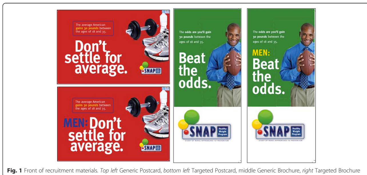
Fig. 1 Front of recruitment materials. Top left Generic Postcard, bottom left Targeted Postcard, middle Generic Brochure, right Targeted Brochure

The postcards (216 mm × 139.5 mm; see Fig. 1 and Additional file 1) included a brief description of the SNAP study including the general purpose of the study, eligibility criteria, and study sponsors. The postcards were full-color, two-sided, and contained 156 words in the study description. The brochures (tri-fold, two-sided, full-color, 216 mm × 279 mm unfolded) contained the same information as the postcards but also included additional information hypothesized to make the message more persuasive. During formative work for this study, young adults in focus groups stated that the immediate benefits of participating in the study would be more persuasive than focusing on the longer-term benefits [8]. To address this, the brochures included a list of immediate benefits of participating in the study (including free personalized analysis of nutrition and