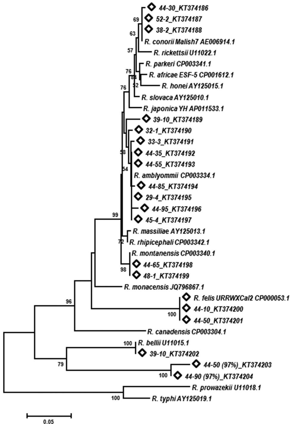
FIG 3 Neighbor-joining tree showing phylogenetic relationships of partial 23S-5S IGS sequences of known Rickettsia species taken from the NCBI database and sequences amplified from D. variabilis ticks. The scale bar indicates an estimated change of 5% 23S-5S IGS. The sequences marked with diamonds were generated in this study. Bootstrap values below 50% are not shown in the tree branches.

field-collected D. variabilis adults will be reported in a subsequent publication.