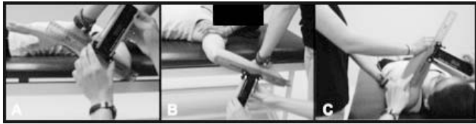
Figure 3. Range-of-motion assessment. A, Internal rotation. B, External rotation. C, Posterior shoulder tightness.

acromial-space distance was defined as the shortest distance between the anterior-inferior tip of the acromion and the superior humeral head (Figure 2B). 17 A 3-trial mean was calculated for each side. Average subacromial-space distance was normalized to height and presented as a percentage. Before data collection, strong intrasession reliability and precision were demonstrated for subacromial-space distance (ICC = 0.91, SEM = 0.04 cm).