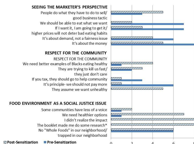
Figure 2. Number of focus groups in which selected codes representing the three main themes occurred before and after sensitization. See text for explanation.