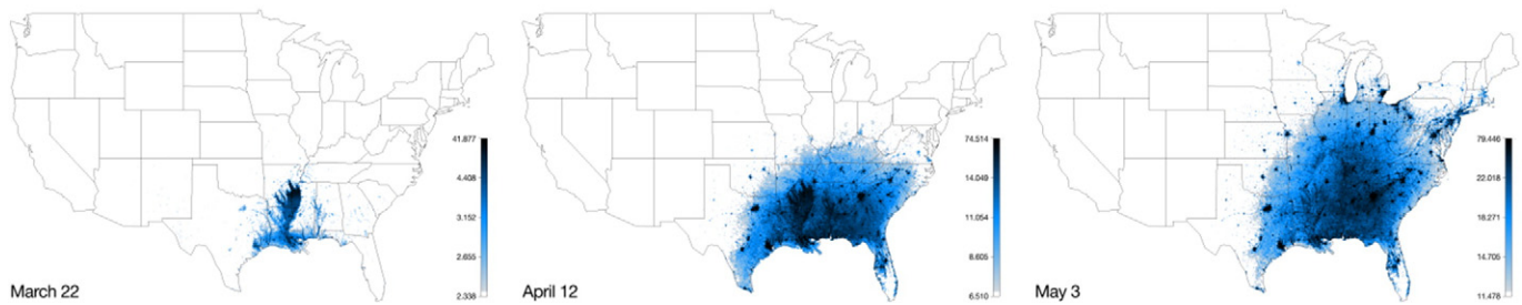
Fig. 3. Heat maps show the northward migration of the chimney swift as modeled by the eBird network. Darker colors indicate higher probabilities of finding the species. The analysis is based on presence-absence data from complete checklists collected under the “traveling count” and “stationary count” protocols from January 1, 2004 to December 31, 2011 within the conterminous United States. The species distribution models were trained using one species at a time, with each based on 1,533,267 checklists made across 238,865 unique locations within this area.