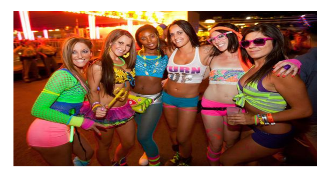
Figure 8.