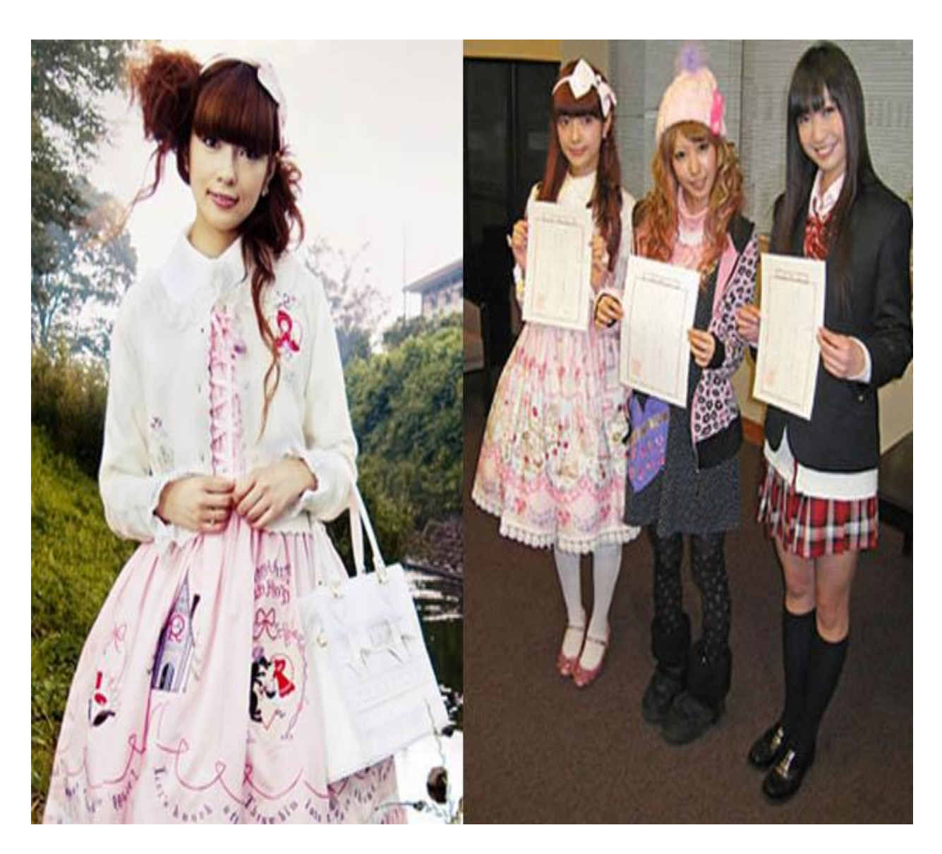
Figure 2. La Carmina, "J-News #2: Japan Fashion Pop Culture Ambassadors, Fruits Magazine Boutique Opens in Shinjuku," lacarmina.com (blog), photograph. March 7, 2009, <a href="http://www.lacarmina.com/blogpics/090307_news1.jpg">http://www.lacarmina.com/blogpics/090307_news1.jpg</a>