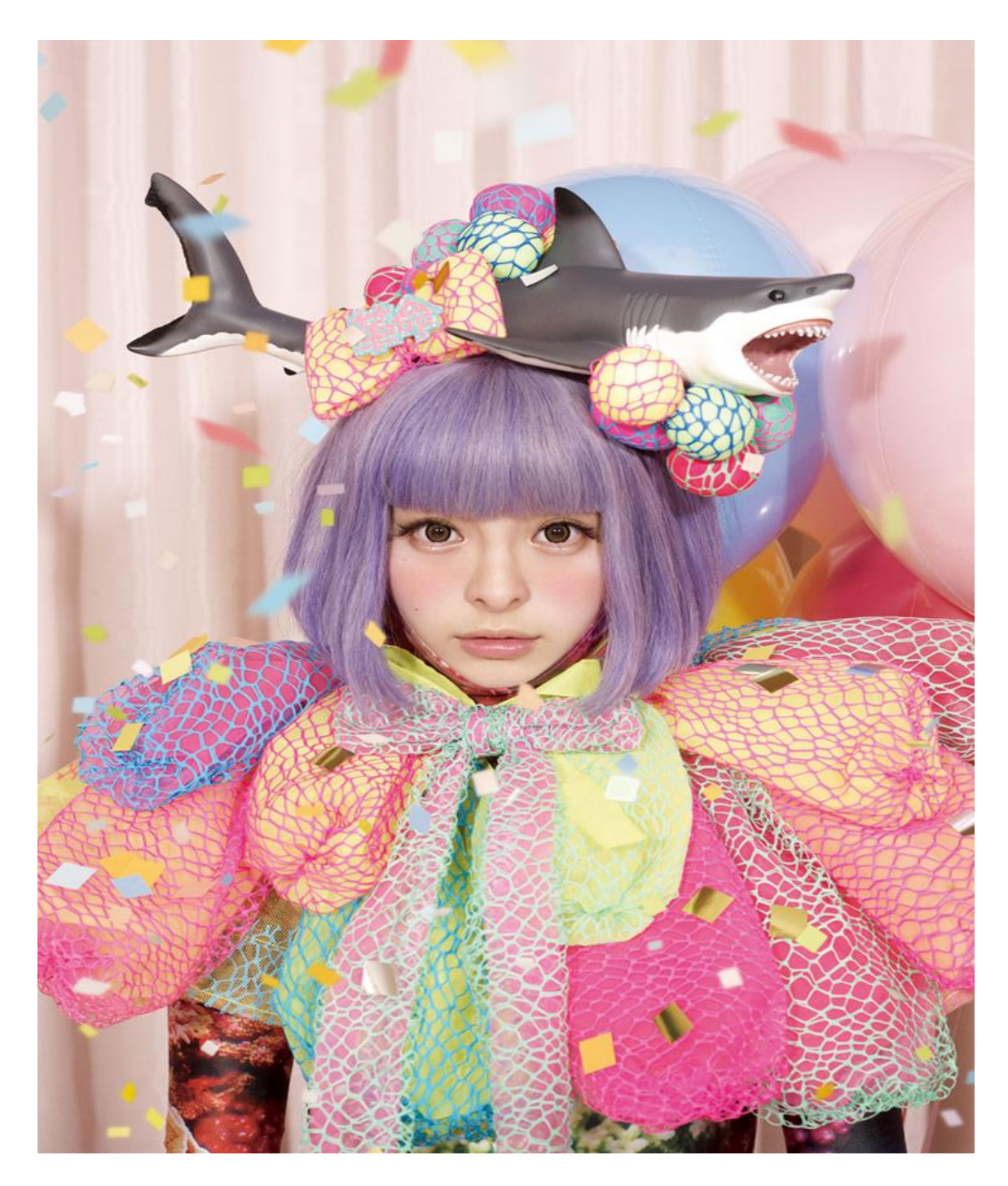
Figure 5. "Kyary Pamyu Pamyu "Furisodation","