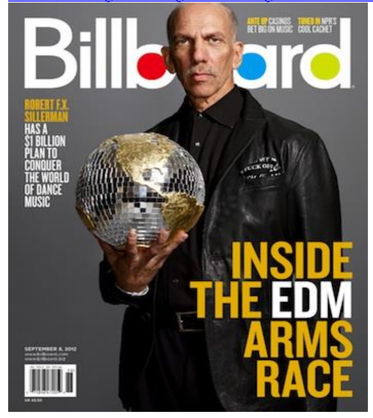
Figure 9. Aswad, Jem, "Music Biz 2012: A Look Back at a Tumultuous Year," billboard.com, photograph. December 14, 2012, http://www.billboard.com/bbbiz/photos/stylus//2566059-Billboard-Cover-Robert-F.X.-Sillerman.jpg