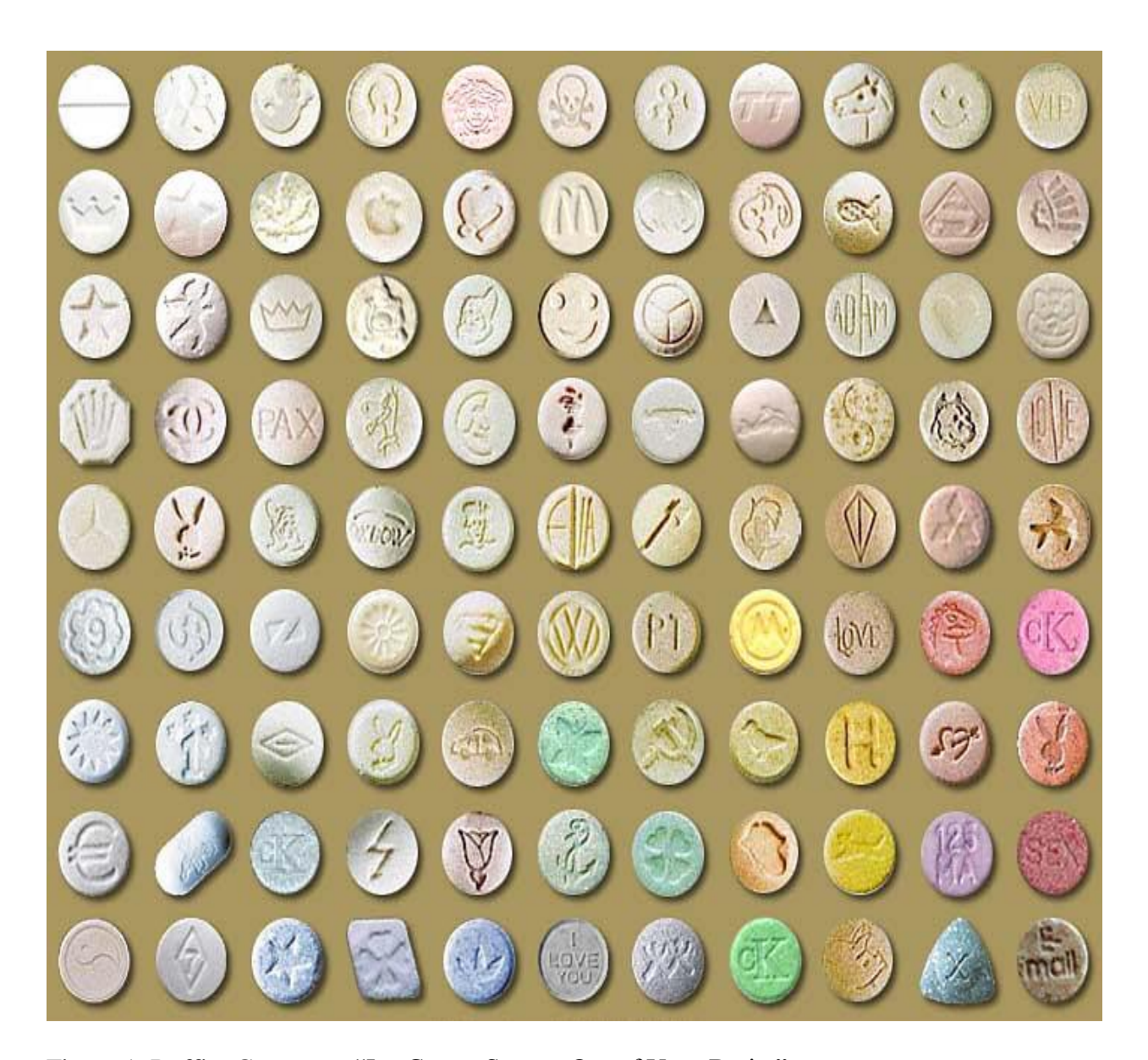
Figure 1. Ruffin, Casanova, "Ice Cream Scoops Out of Your Brain," Digression, News (blog), steelcloset.com , photograph. October 30, 2009, <a href="http://steelcloset.com/wp-content/uploads/2009/10/ecstasy-pill.jpg">http://steelcloset.com/wp-content/uploads/2009/10/ecstasy-pill.jpg</a>