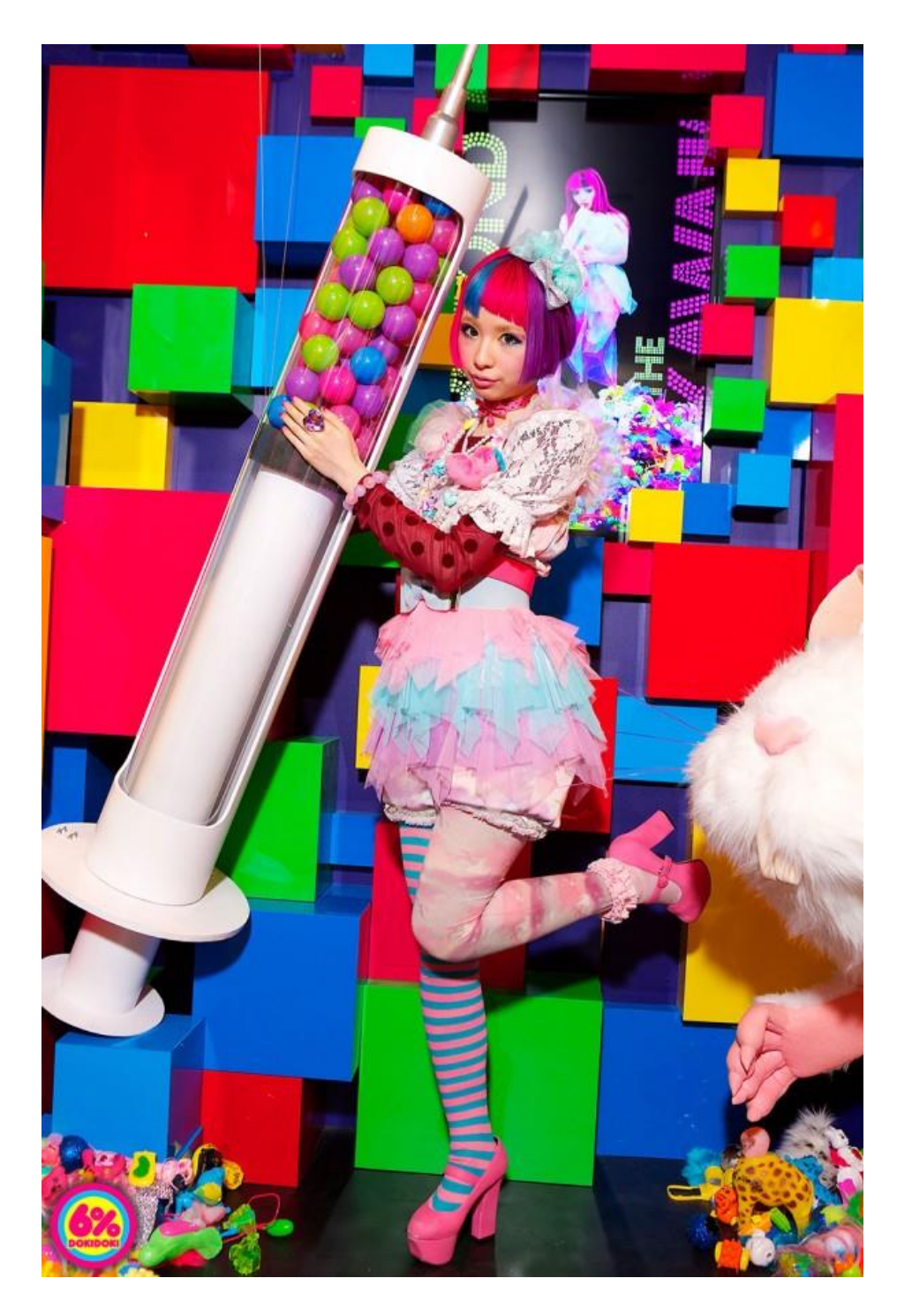
Figure 7. "6%DOKIDOKI "Beyond the Kawaii" Evolution & Harajuku Shop Renewal," tokyofashion.com , photograph. November 19, 2013, <a href="http://tokyofashion.com/6dokidokibeyond-the-kawaii-harajuku/">http://tokyofashion.com/6dokidokibeyond-the-kawaii-harajuku/</a>