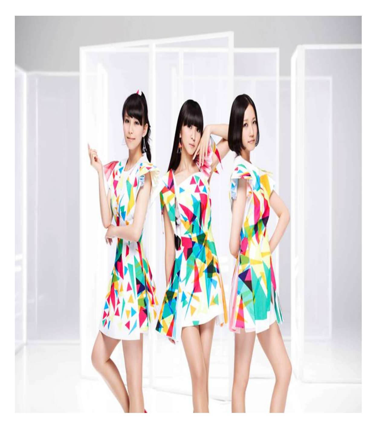
Figure 4. "Malaysia's Largest Online Community," lowyat.net , uploaded by user "MadhavenR," photograph. March 17, 2014, <a href="https://forum.lowyat.net/topic/3164373/all">https://forum.lowyat.net/topic/3164373/all</a>