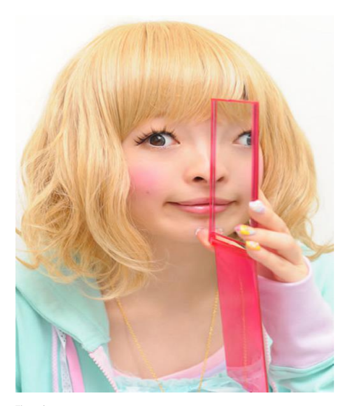
Figure 3. "Derp Girl Derp," 9gag.net , photograph. Accessed February 12, 2014, <a href="http://d24w6bsrhbeh9d.cloudfront.net/photo/agyyZyg_700b.jpg">http://d24w6bsrhbeh9d.cloudfront.net/photo/agyyZyg_700b.jpg</a>