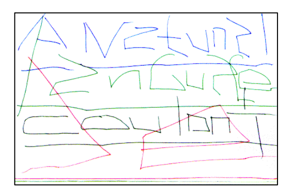
(fig. 2, Grenier, For Larry Eigner 12)

Fig. 1 appears to read "moon / letters / page" and includes a red circle with a line through it (red ink). One of his most legible drawn poems, shown in fig. 2, appears to read "A Natural / Language / couldn't / be." In both poems, Grenier's self-reflexive language comments on the inevitable distance between language and nature. He clearly distinguishes the physical ("moon") from its translation to language ("letters") and its final placement in text (on the "page") in fig. 1. In fig. 2, though, the later poem in the For Larry Eigner sequence, the poet dismisses the possibility of reconciling the unadulterated physical world with language as he implies that language can never be "natural." Moving past the quest for language to express nature, the sequence embraces the immediacy of the moment and the experience in all of its mediated wonder.