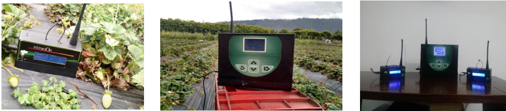
Fig. 2. IoT sensors central connection in strawberry crop.

A wireless hierarchical system was developed. The sensors are used in 8-bit low consumption microcontroller. Transmitters in reception consume 50 mA and in low consumption 30uA as given in technical specifications of the manufacturer. The different data frames must vary at the connection level with the server due to bandwidth consumption. It is not the same to collect data from 100 sensors to collect crop data with 4 sensors. Due to this fact, a data packet detection algorithm is determined for later sending. Within this routine, a cyclic redundancy code is implemented for receipt confirmation and confirmation with the server is implemented within the TCP protocol. The images of the final prototype are shown in Fig. 2.