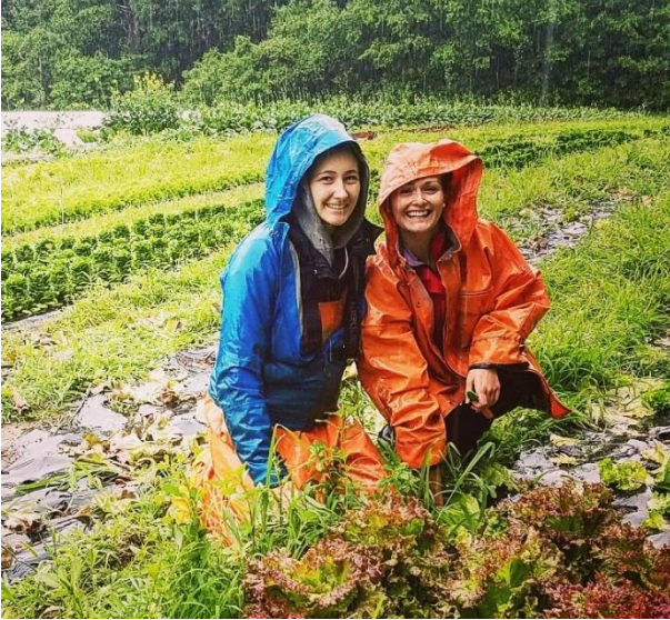
The author collects unharvested produce with staff from NH Gleans.

nutritional quality. For that reason, many food assistance providers have started to incorporate local produce in their distribution by collaborating with an organization called NH Gleans.