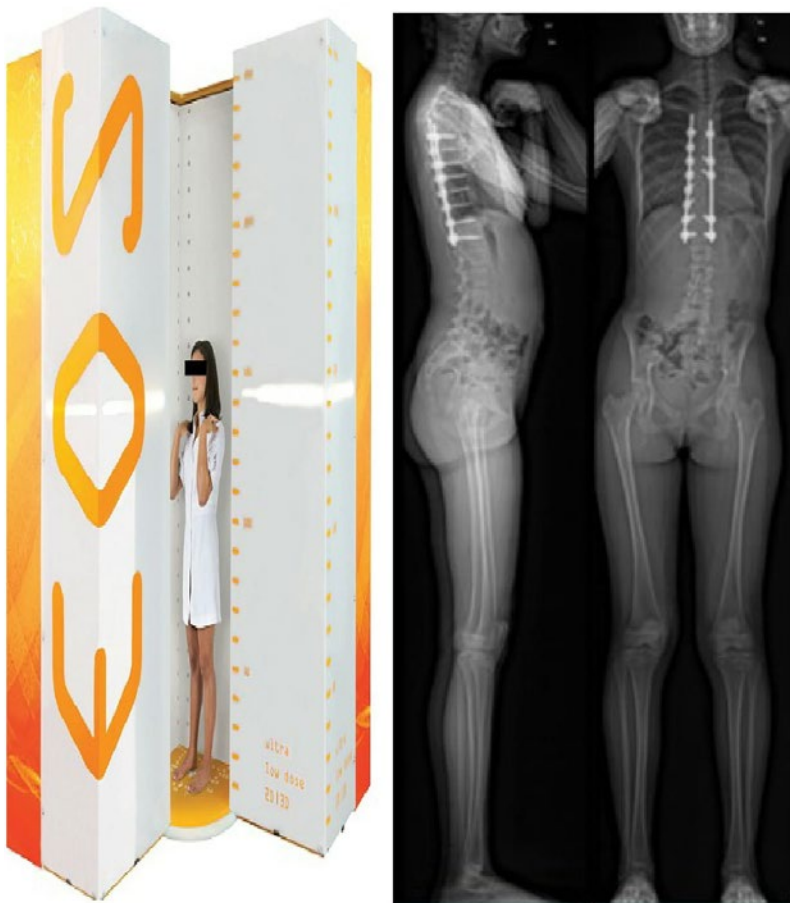
FIGURE 1 / Illustration of the EOS low-dose scanner and the outcome.

tients was estimated by calculating the theoretical amount of full-body absorbed radiation dose in terms of effective dose in mSv. In order to calculate the cumulative radiation dose from CR and EOS, the number of images divided by two (coronal and lateral planes) was multiplied by effective dose references for CR and EOS stereo-radiography for full-spine examinations. The reference doses for full-spine examinations were estimated based on phantom dosimetry [6]. Reference doses: CR anterior-posterior-lateral (APL) projections (0.545 mSv) and EOS standard-dose APL projections (0.220 mSv). All doses were calculated according to the International Commission of Radiologic Protection (ICRP), ICRP-103 approach [7].