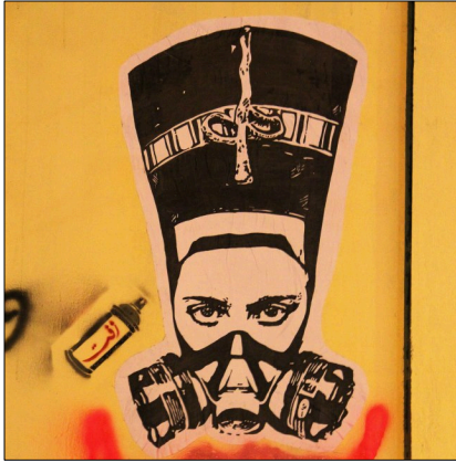
Figure 1 Mohamed Mahmoud Street, Downtown Cairo, 2011.