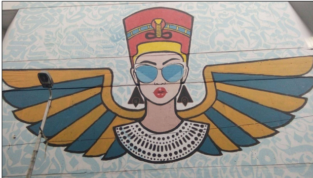
Figure 3 Mohamed Mahmoud Street, Downtown Cairo, captured in December 2017

with all its memories, what is revolutionary, and what is commercial, and who gets to decide. It is a manifestation of power through visual production and meaning making (Eickhof, 2015).