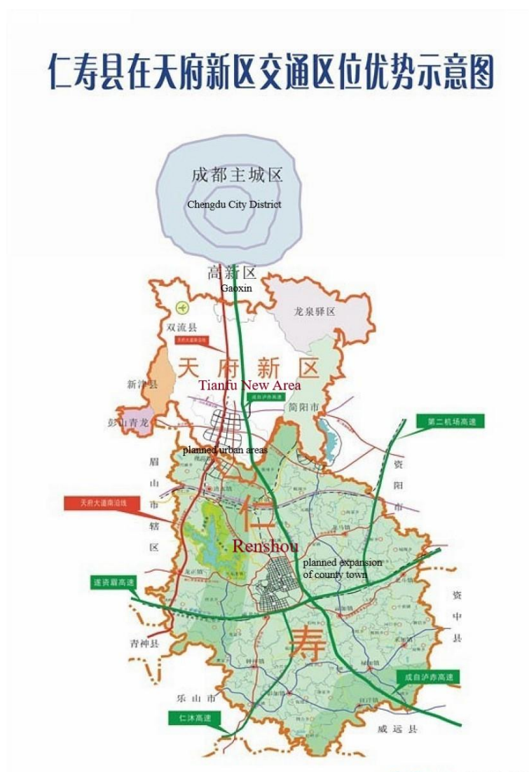
Figure 3. Renshou County's 2011 vision of its relationship to Chengdu.

Notes: Map courtesy of Renshou County. English text by author.