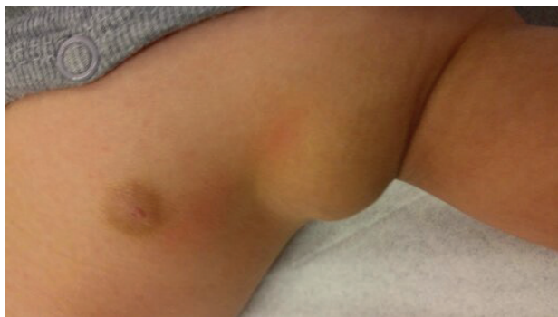
Fig. 1. Severe lymphadenitis of the axilla after Bacillus Calmette-Guérin vaccination of the ipsilateral arm.

A Greenlandic Inuit boy was born at term after an uncomplicated pregnancy and normal vaginal delivery. Intracutaneous BCG vaccination was given in the left upper arm. He was discharged from the regional hospital and went home to the rural village in which the family lived. A few weeks later, the mother observed a swelling in the left armpit and contacted the hospital. A large swelling in the left axilla was found (Fig. 1). The swelling was painless, smooth, firm, and not fixed to the underlying tissue. There was no erythema or other cutaneous changes. The BCG inoculation site was without signs of infection (Fig. 2.) The child was thriving and gaining weight and did not show any signs of systemic affection. An ultrasound of the swelling did not detect any fluid. Neither biopsy nor excision was performed. After 3–4 months, the swelling decreased in size, and after 6 months it had disappeared.