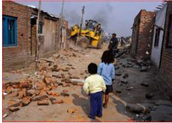
Figure 2 Thapathali Sukumbasi Area being demolished by Nepal Government