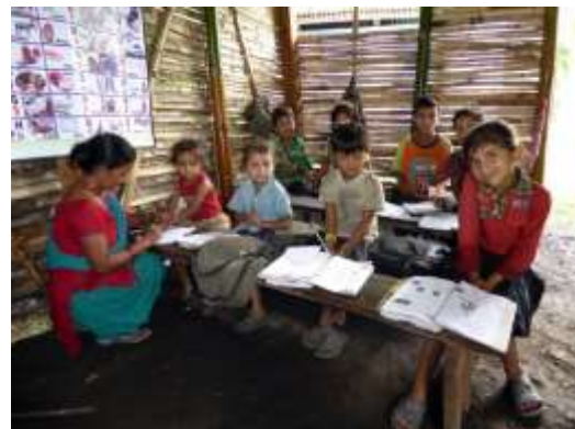
Figure 3 Classroom after Nepal Earthquake (left), children studying in temporary classroom (right).

Development of Fit-For-Purpose Land Administration Country Strategy: Experience from Nepal (UN-HABITAT GLTN) (10049)