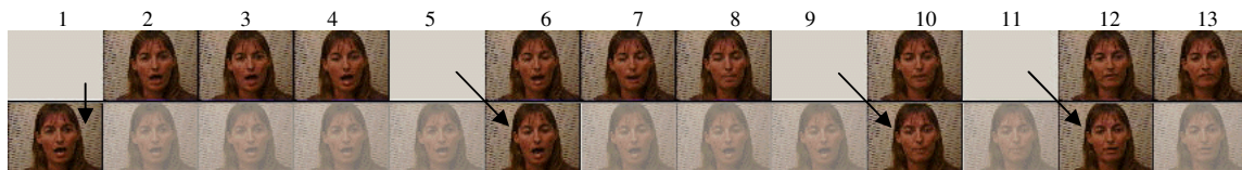
Figure 1: Example of a key frame selection process (bottom row) from a 30fps video (top row)

The picking algorithm is demonstrated in the video sequence in Figure 1 displaying the ‘abab’ part of the stimulus word ‘ababava’. The top row depicts the original 30fps sequence with the frames 1, 5, 9, and 11 cut out and used as the key frames in the key frame sequence in the bottom row. Frame 1 was chosen due to rule 1. Frames 5, 9, and 11 were selected according to rule 2 and were subjected to the 33ms delay in the resulting stream. The light pictures in the key frame row signify the presentation time of the key frames. We emulated the key frame algorithm by creating copies of the key frames and filling up the 30fps grid with them until the next key frame was chosen.