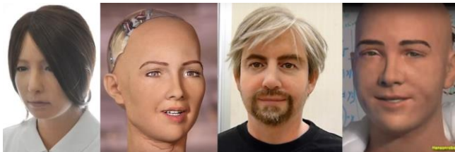
Figure 1. Screenshots from the videos depicting the four androids: Geminoid-F, Sophia, Geminoid-DK, and Jules (left to right).