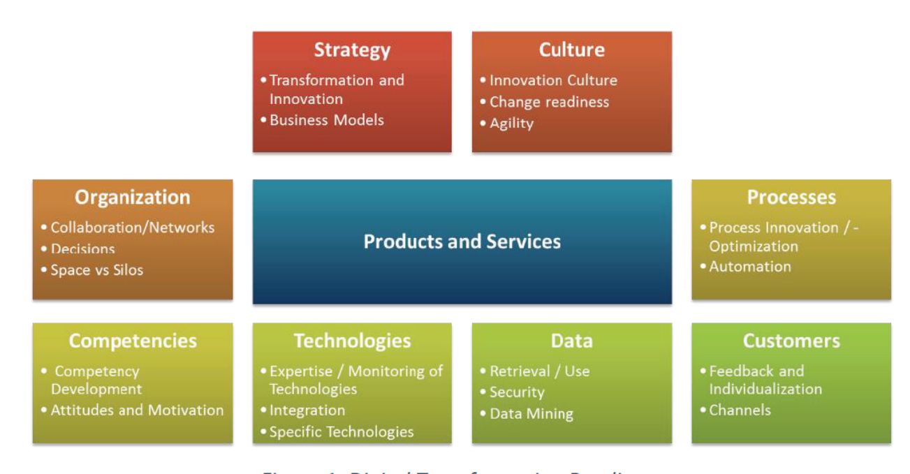
Figure 1: Digital Transformation Readiness

As a first step, it is necessary to understand the status of organizations in the digital transformation process. The following figure shows the key aspects and influence factors to be addressed.