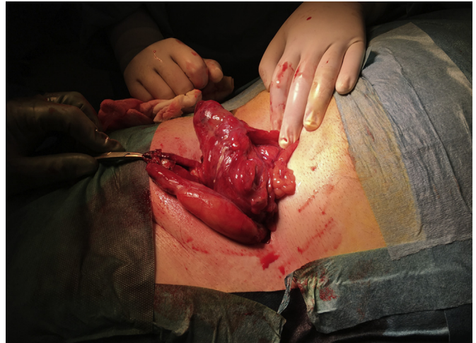
Fig. 2. The hernia sack was opened and access to the intra-peritoneal cavity was established. The colon was then retracted and the diagnosis of a hypertrophied EA was confirmed followed by an uncomplicated resection of the EA.

Operation under general anesthesia was performed via incision parallel to the left inguinal ligament. The size of the EA made several differential diagnoses possible (Fig. 1). Upon exploring the mass after incision, a rubber-solid smooth mass originating from the abdomen was palpated (Fig. 2). Sigmoid colon could be pulled and inspected through the incision. The diagnosis was confirmed