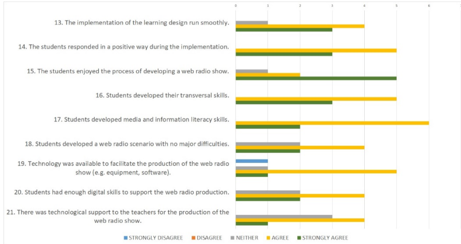
Fig. 2. Teachers' perceptions on the implementation of NESTOR

of the students['] written speech into a radio speech and also the production and recording of the broadcast.”